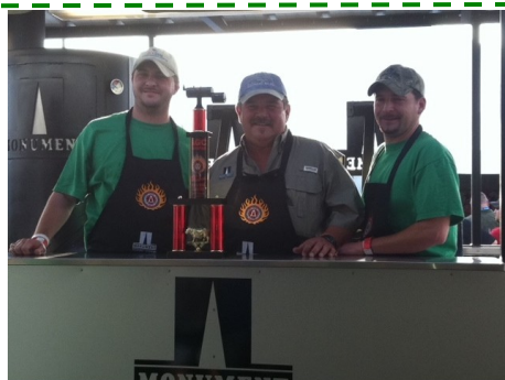
pictured L to R: