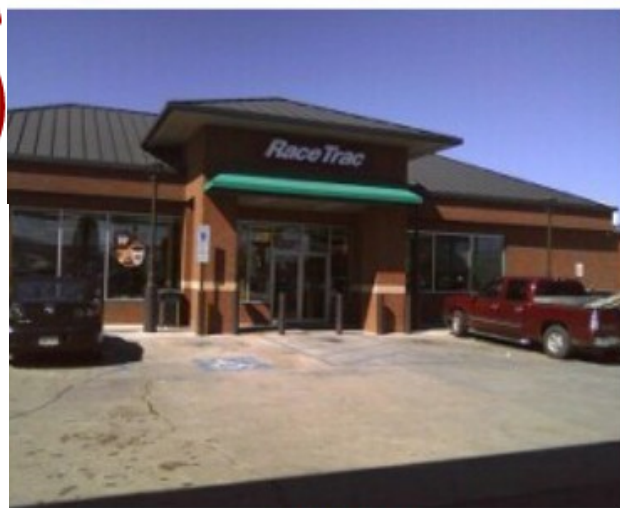
Baton Rouge, LA