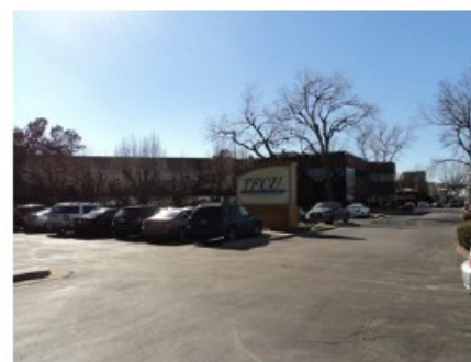
Oklahoma City, OK

Credit unions and banks can be referred to as financial institutions. They are facilities that help store money and are good for the economy.