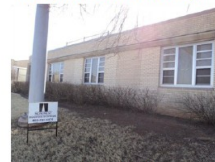
Oklahoma City, OK

Monument is pleased to assist in helping Oklahoma go green. A Duro-Last roof system is known as The World's Best Roof. has been installed on a state building located at: