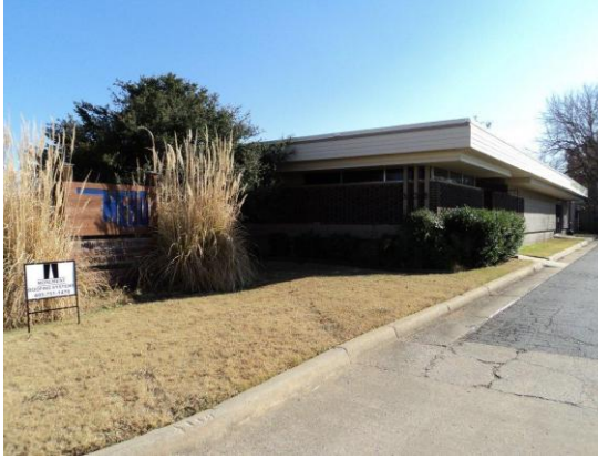
Oklahoma City, OK